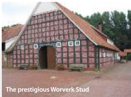
The prestigious Worverk Stud

I really still can't believe it, after two weeks I am on cloud nine, every morning I go down to the stables I can't believe my eyes and my ears, he talks to me quietly with low murmuring