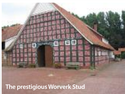
The prestigious Worverk Stud

I really still can't believe it, after two weeks I am on cloud nine, every morning I go down to the stables I can't believe my eyes and my ears, he talks to me quietly with low murmuring