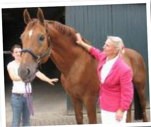
When we met in Germany for the first time

His dam line is the former DLG Champion Mare Hirtin, Havanna (El.St) by Goldlowe (who was sold to Sweden and produced many good dressage horses). His sire Rubenstein has produced many GP horses both mares and stallions.